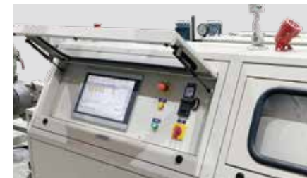
TSE-90 押出機 TSE-90 Extruder